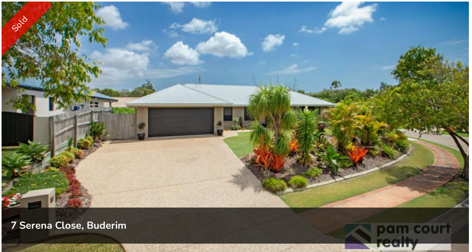
7 Serena Close, Buderim