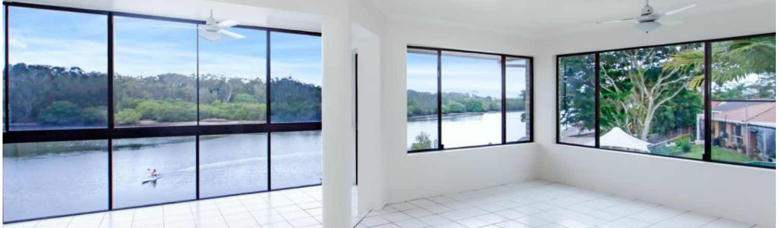
Unit 18, 39 Cootamundra Drive, Mountain Creek