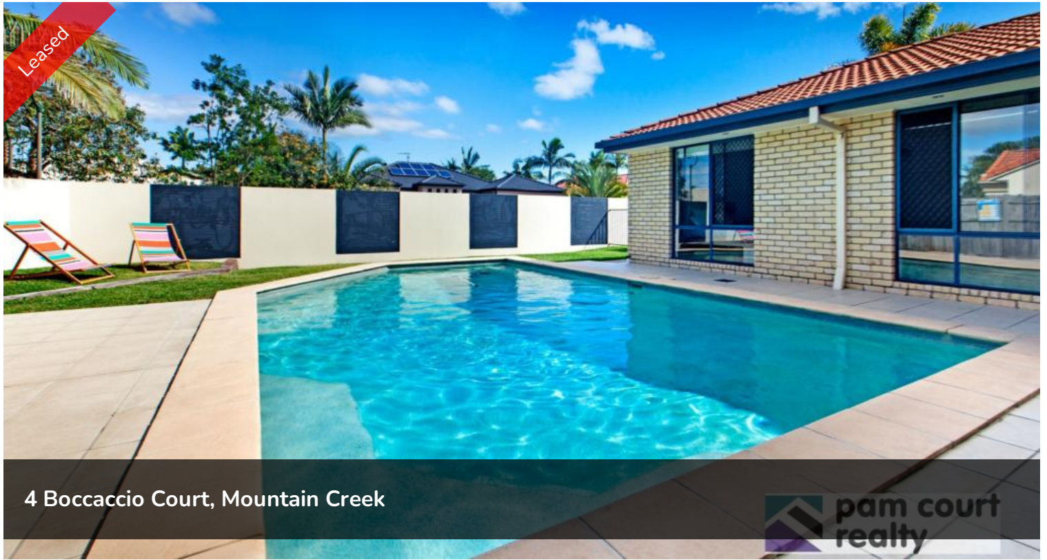
4 Boccaccio Court, Mountain Creek