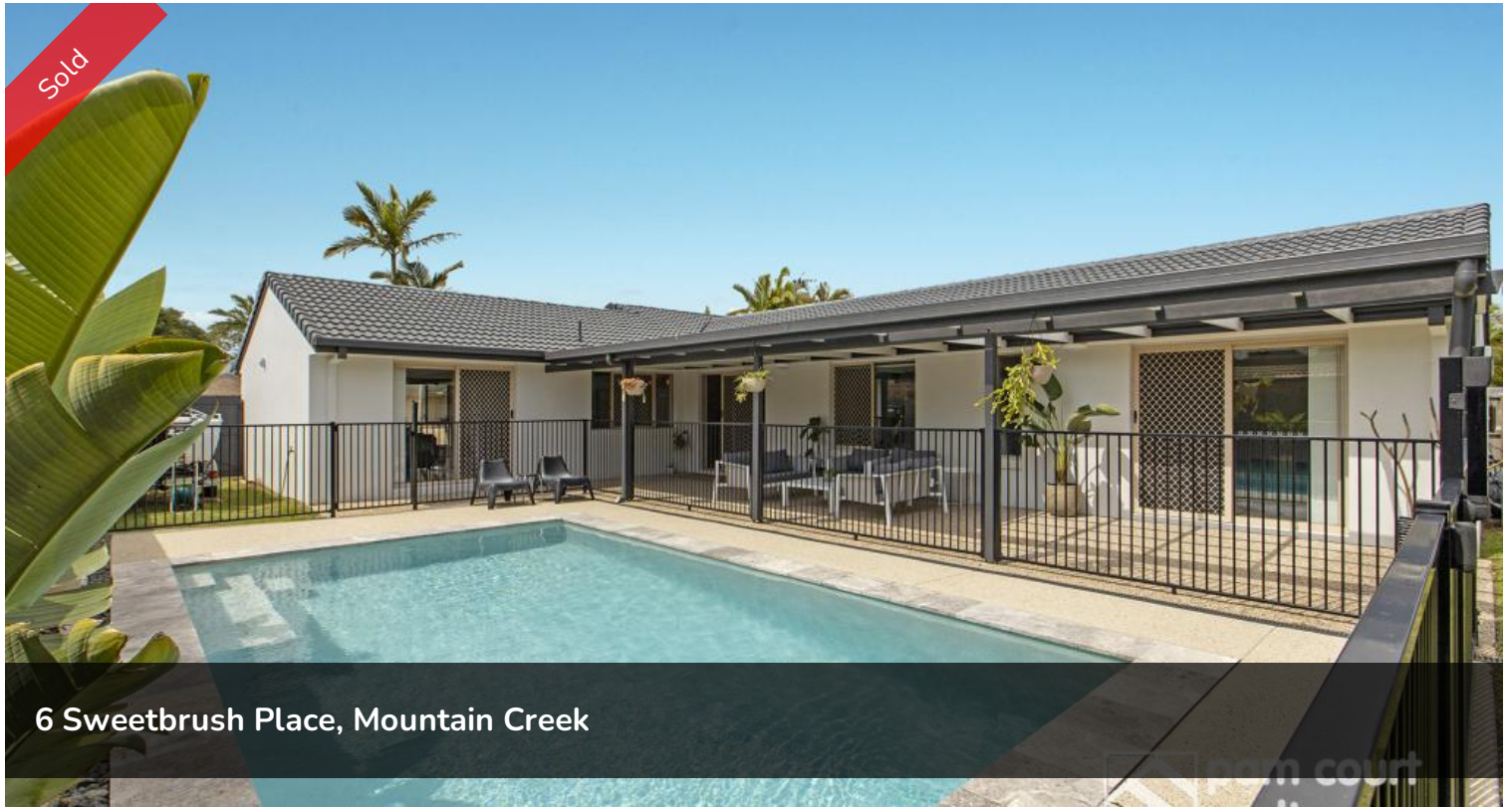
6 Sweetbrush Place, Mountain Creek