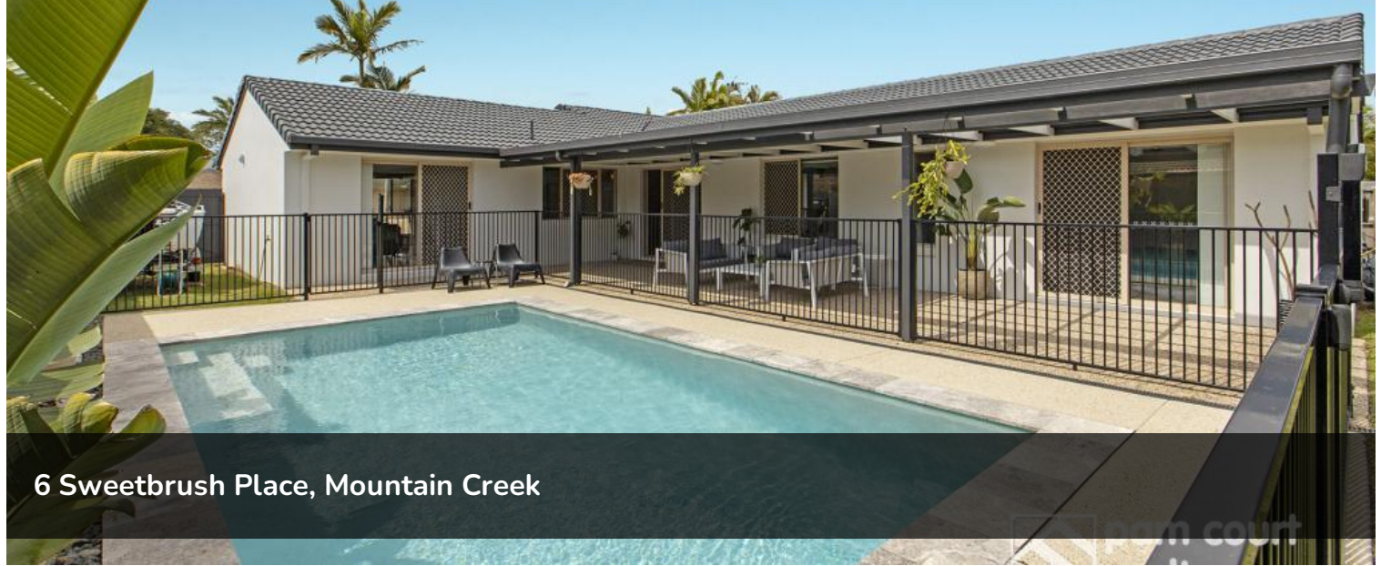
6 Sweetbrush Place, Mountain Creek