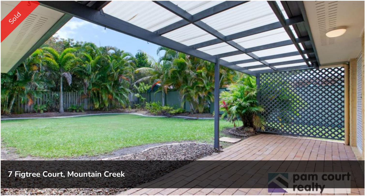
7 Figtree Court, Mountain Creek