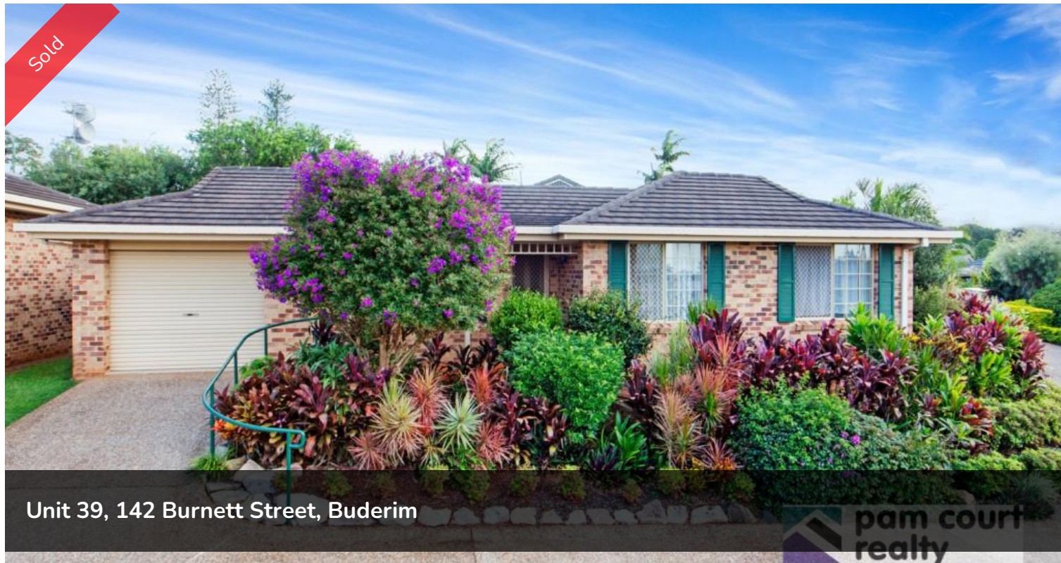
Unit 39, 142 Burnett Street, Buderim