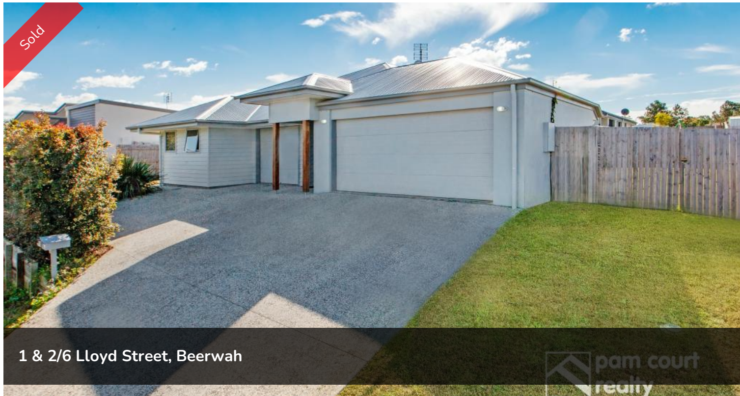
1 & 2/6 Lloyd Street, Beerwah